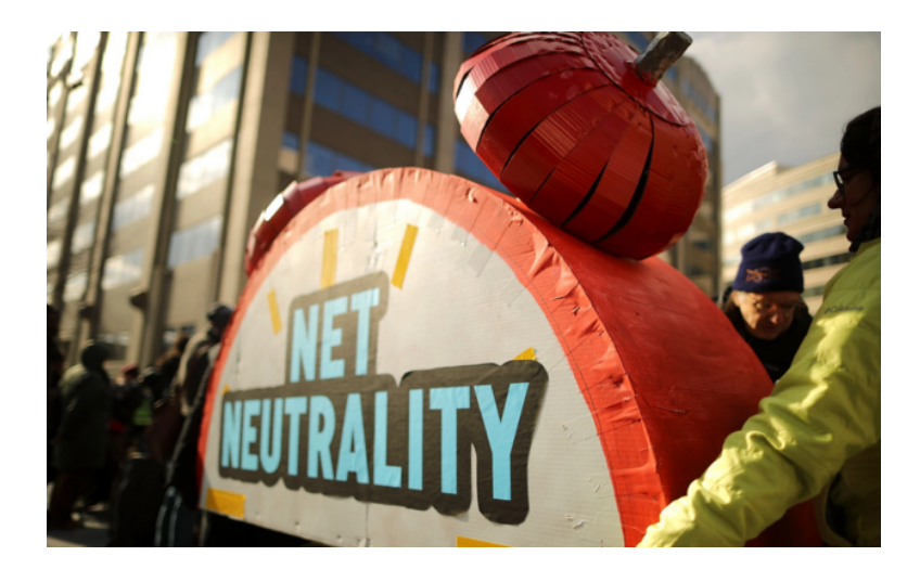
Figure 3: People Rooting for Net Neutrality

have equal access to the internet. By preventing discriminatory practices, net neutrality promotes digital inclusion and reduces the risk of creating a digital divide between those who can afford faster access and those who cannot. In its absence, individuals and communities with limited resources may face additional barriers in accessing crucial online services, educational resources, and economic opportunities, leading to unfair disadvantages.